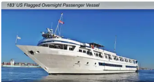
183' US Flagged Overnight Passenger Vessel